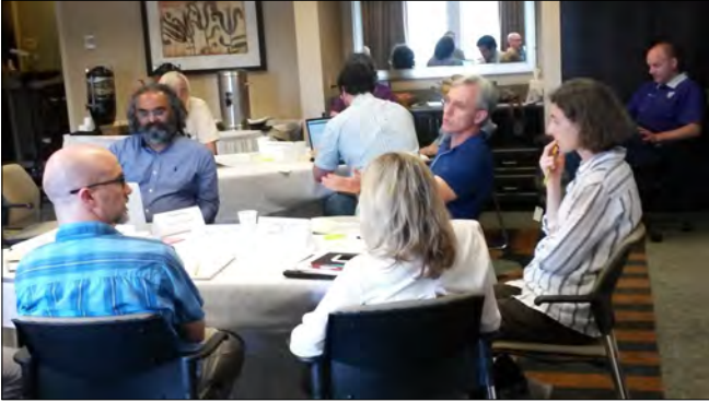
Inter-disciplinary discussions continue around the tables.

Team members gathered in Mankato, Minnesota, for project updates and interdisciplinary interactions.