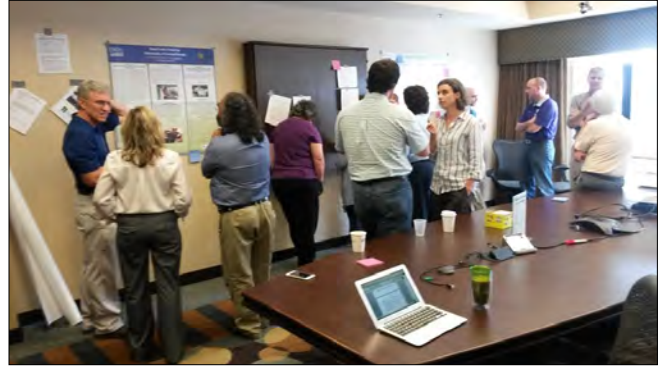
Collaborators interacting during a poster session.